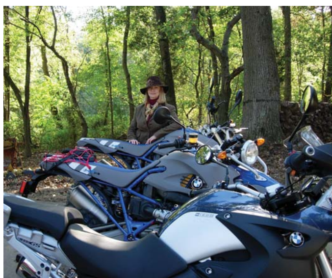
The exotic BMW R1200 GS HP2 wowed even the horse crowd in Tennessee.

Just a hour's ride south of Nashville, in Shelbyville, Tennessee, surrounded by prim barns and spotless stables, 1,700 BMW motorcycle fans assembled for all over North America and beyond. They were rewarded by a unique rally site, numerous vendors, and a fleet of brand-new demo BMWs courtesy of