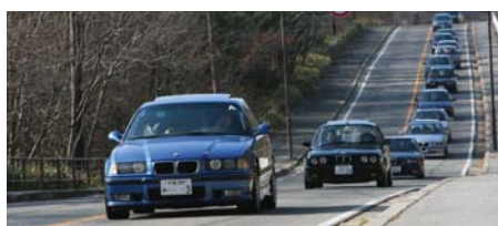
Convoy of the BMW Club of Japan.

The second day began with a drive-by procession of cars at the foot of Yatsugatake Peaks, to Moegi-no-Mura. Participants