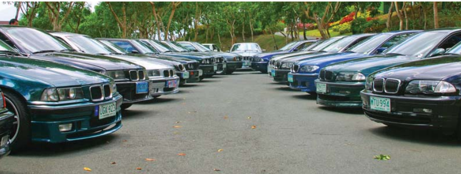
Club vehicles line up.

activities whilst encouraging safe and skillful driving. The vision was to enhance the skills of the BMW driver so that he or she can enjoy to the maximum the ultimate dri