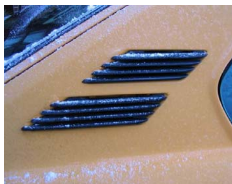
Touring in snow.

www.bmwmotoclub.com.sv www.classicmotorshow.de www.classicmobil.de www.retroclassics.de www.siha.de www.bmw-mc-vl.be www.veterama.de www.technorama.de/ulm www.bmw-veteranenclub.de www.bmw-02-club.de www.bmw-club-europa.org