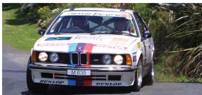
On victory road.