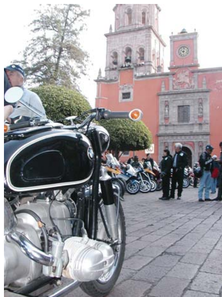
The town of Queretaro.