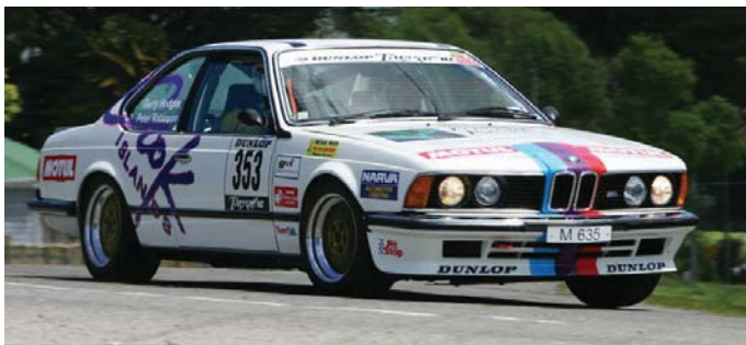
Targa 2005 New Zealand.

the Wairarapa & the Southern Hawkes Bay through some of the most amazing scenery this country has to offer.