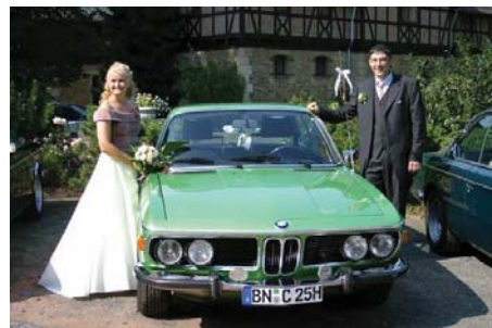
A special vehicle for a special occasion.

Once again we can look forward to numerous events featuring BMW automobiles and motorcycles. You will find an overview of the first few events here. If you find your event is missing, please send us the relevant information. You will also find a current calendar of events on our website at www.bmw-clubs-international.com .