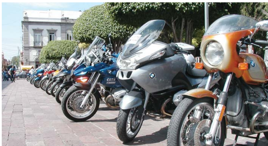
Yesterday and today.

rally. Everyone is even provided with nametags with a detailed schedule of events in a plastic holder.