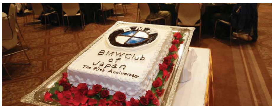
The anniversary cake.

celebrate the 30th anniversary of the debut of the BMW 3 Series. The event took place at Yatsugatake Plateau in Yamanashi