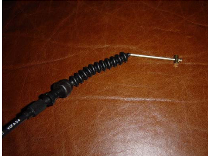
Picture 1 – Throttle Body side of Bowden Cable 65 71 2 228 748