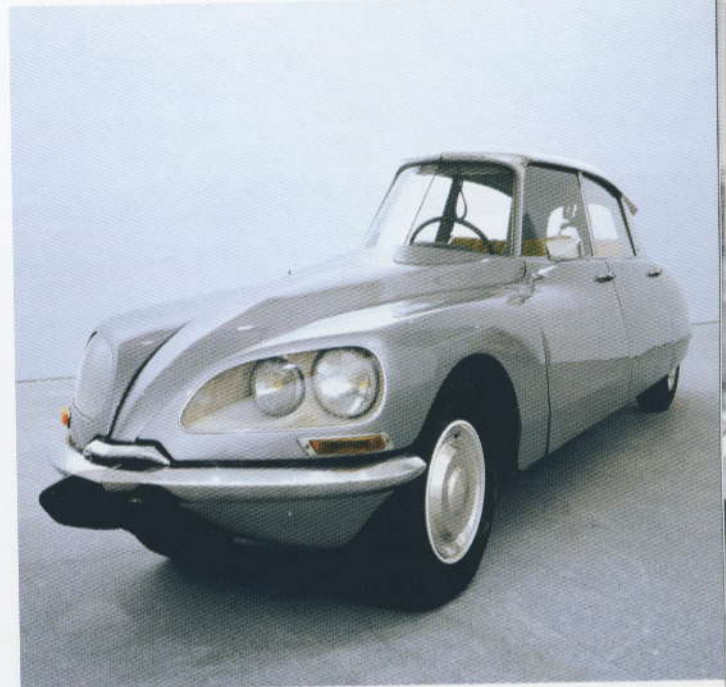
Mexican artist Gabriel Orozco used his artistic skills to reduce this Citroën DS to an undrivable single-seater.

Through a “different perspective on the automobile in modern and contemporary art”, according to the exhibition concept, the car should instead be exhibited as an independent object and the interplay of form and content pre-