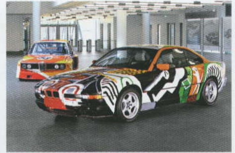
The Art Cars by Andy Warhol (left) who painted the car with his own hands, Robert Rauschenberg (centre) and David Hockney (right).

Bilbao, in the Paris Louvre and in Sydney's Powerhouse Museum.