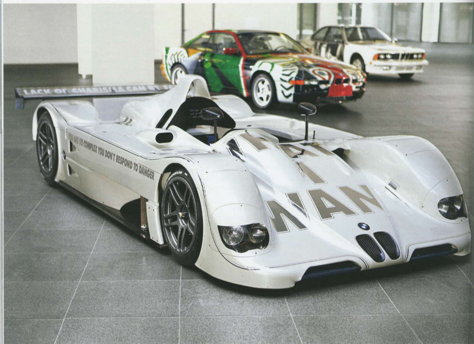
The BMW V12 racing car, designed by American concept artist Jenny Holzer in 1999.