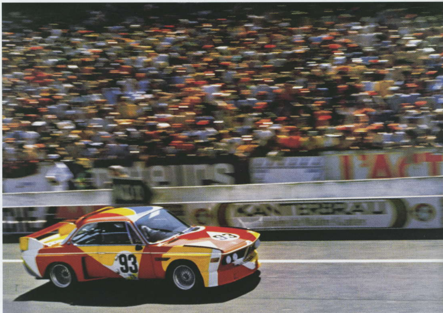
Premiere on asphalt: The BMW Art Car by Alexander Calder at Le Mans 1975.

most sophisticated toy of people who want to be taken seriously. We thank Calder and we thank Hervé Poulain because they still know how to have fun and because they give us pleasure." A week later, people in